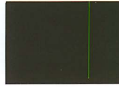
Burnished Slate *