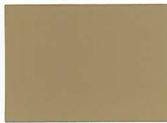
Sahara Tan *